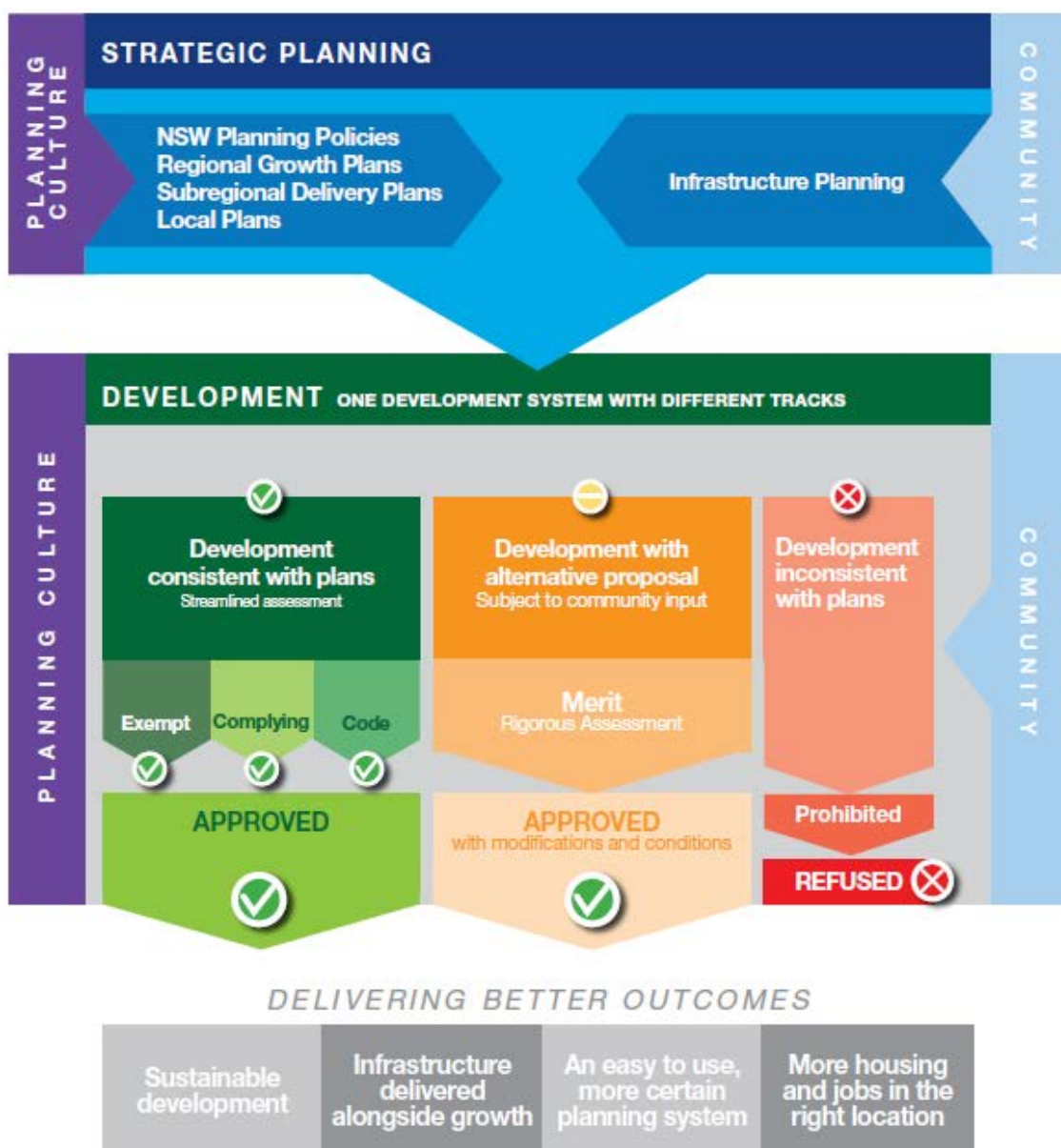
Figure: The new planning system at a glance 169

... to promote economic growth and development in NSW for the benefit of the entire community, while protecting the environment and enhancing people’s way of life. To do this, the planning system has to facilitate development that is sustainable. Sustainable development requires the integration of economic, environmental and social considerations in decision making, having regard for present and future needs. 168